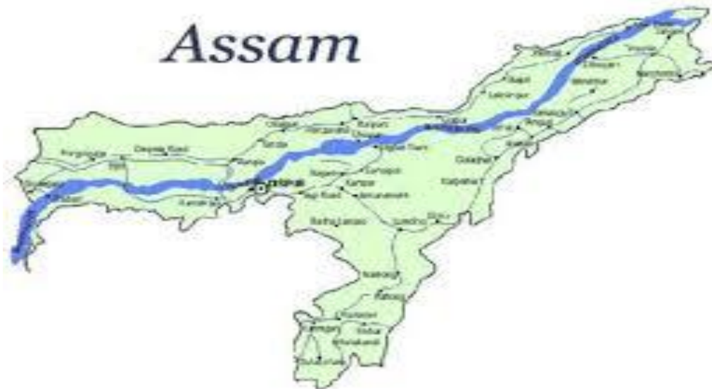
Figure: 1 (The river Brahmaputra through Assam)