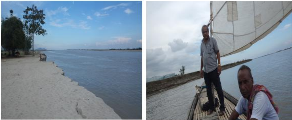
Figure:3 (Picture of river bank erosion in lower Assam region of river Brahmaputra)