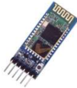
Fig. 4 HC-05 Bluetooth Model [4].

HC-05 is a MASTER / SLAVE module using for transmitting the data between the PC and the Arduino. In our robot car the Bluetooth send the sensors data to the pc and receive the movement instructions from it. Fig. 4 showing the HC-05 Bluetooth model.