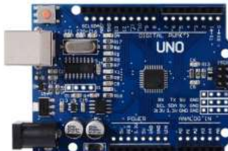
Fig. 3 Arduino Uno [4].

One of the most popular microcontroller boards in this days is an Arduino. it can be powered by battery or using AC to DC adapter.it is based on the AT mega 328. ATmega328 is a microcontroller chip with capacity of thirty two kilo bit instruction per second flash memory. It has 23 General purpose input-output lines and operater between 1.8-5.5V. There are two different types of input in the Arduino. in general it has 14 pins with digital signal. The rest 6 pins with analoge signal. Arduino microcontrollers can be programmed with a boot loader that simplify the process of uploading programs to the on-chip flash memory. Fig. 3 showing the Arduino Uno which used it in our robot car.