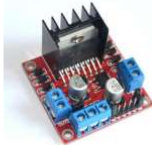
Figure 3.2 the L298n Motor Driver [4].

The L298n driver allow the controller to control the speed and direction of two DC motors in each side with ease. It can be used with motors that have a voltage between 5 and 35V DC. The L298n designed to accept standard TTL (Transistor-transistor logic: is a class of integrated circuits which maintain logic states and achieve switching with the help of bipolar transistors. Fig 2 showing the L298n.