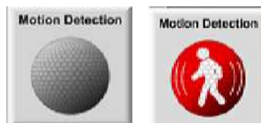
Fig. 7 Motion Sensor Output

The motion sensor, in the right bottom side, showing motion signal if there is a motion. Fig. 7 showing motion sensor detection in two state first gray which mean no motion detected. Second red which mean motion detected.