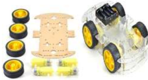
Fig. 1 Robot Car Chassis [4].