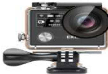
Fig. 5 Eken action camera [5].

Eken h9 is an action camera with many features made it suitable for our robot car. The main important feature is the Wi-Fi connection. Also it has many other features such as 170o wide angle lens, 12mega pixels CMOS-sensor ... etc. Fig 5 showing the eken h9 camera.