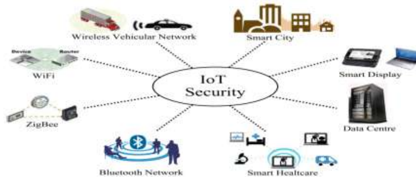
Figure 1: IoT security applications

The traditional network and Internet of Things (IoT) are different from each other in many areas, starting from the architecture to applications. Design of an IoT system is a challenging task because of certain limitation like platform, connectivity, close firmware, processing power, storage, hardware limitations, etc. Tradition network can be a closed system as compared to that of open IoT system. Some of the current IoT challenges are availability, reliability, mobility, performance, management, scalability, interoperability, security and privacy [1].