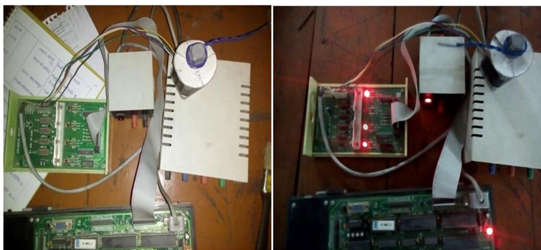
Fig 2. Physical appearance of interfacing diagram of stepper motor with 8051 microcontroller (a)with out executing the assembly language program and (b) with executing the program

To carry out the experiment to rotate the shaft of the stepper motor, the stepper motor trainer kit was purchased from the Physitech Electronics, Secunderabad, Telanagana state, India., and the 8051 microcontroller trainer kit was taken from Advanced Electronics, Banagalore, Karnataka, India., and the details were given in a lab manual [9]. The practical circuit diagram without executing and with executing the assembly language program was given in Fig. 2a&b. It was observed from Fig. 2a that no LED was glowing, but in Fig. 2b, three LEDs are in the glowing state and only one LED was in the off state and through it the required data was reached to the stepper motor coil. Sending a single data for longer time may produce heat in the coil and chance of damaging the circuit. Therefore precautions were taken to maintain smaller time delay between each data.