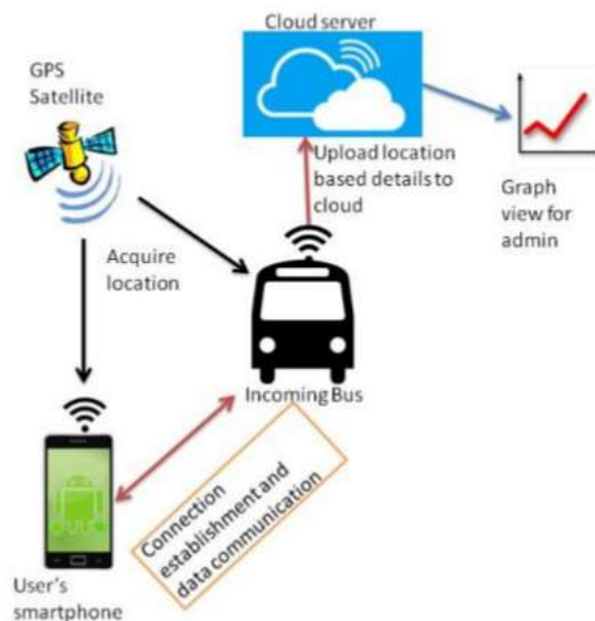
Figure 1: Working structure of system

H] The work proposed by Sharad S, et.al. [8] titled. " The Smart Bus for a Smart City - A real-time implementation" a prototype to make buses communicate to the commuters in a Smart City ecosystem has been proposed and developed. This system uses Internet of Things to build the ecosystem to connect the bus to the Internet and thus, to the commuter and transport managers. With Artificial Neural Networks and Statistical Modeling techniques, algorithms and models are built from historical data to predict the ETA efficiently. limitation of their system is that the buses are not connected to each other since they can't show the live traffic update. For achieving the better result of their system they need to make an android application to provide the real time schedule of the buses.