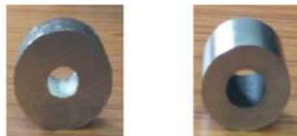
Unmachined and Machined specimen