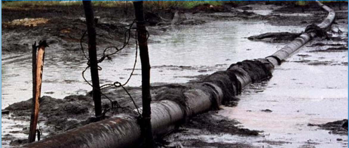
Plate 1: Land degradation due to leakage from crude oil pipeline in the area