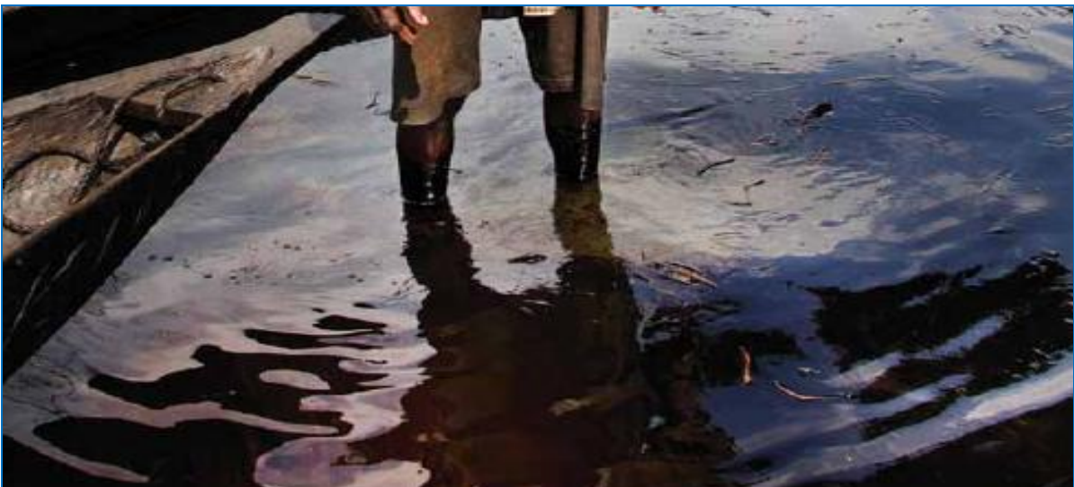
Plate 3: Surface water contaminated with crude oil in the area