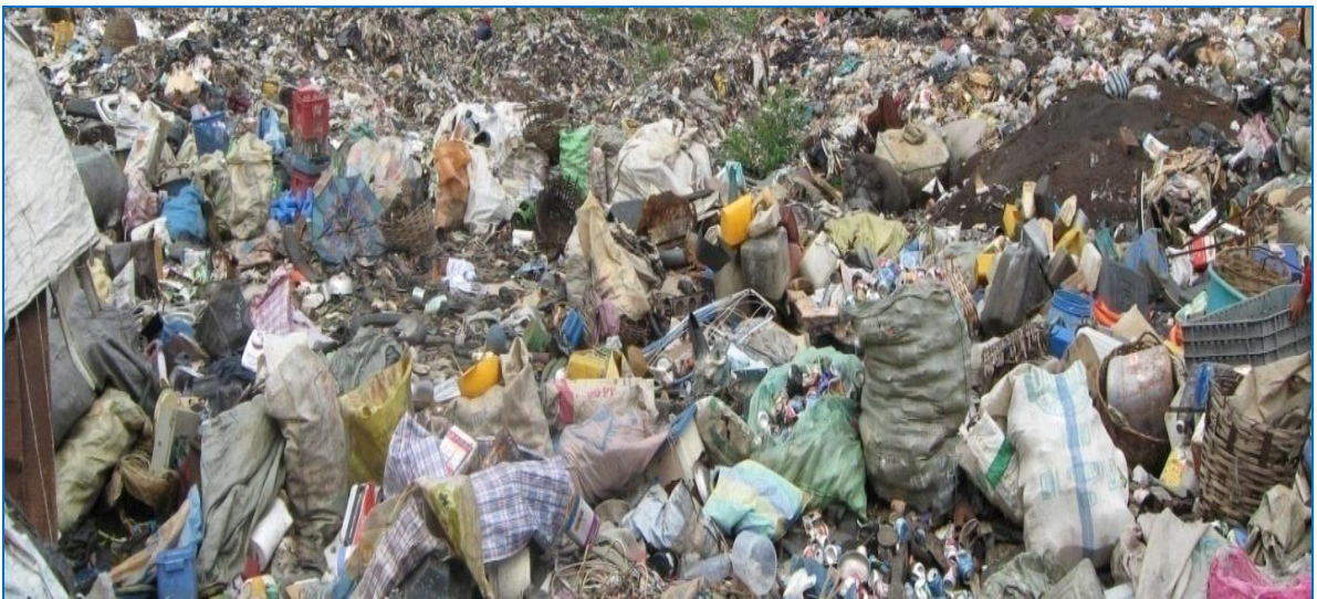
Plate 2: A front-view of a dumpsite in the area