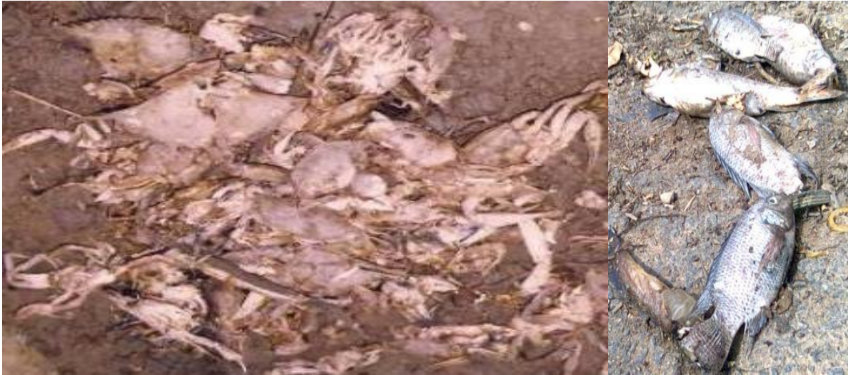
Plate 4: Death of fishes and craps due to hydrocarbon contamination of rivers