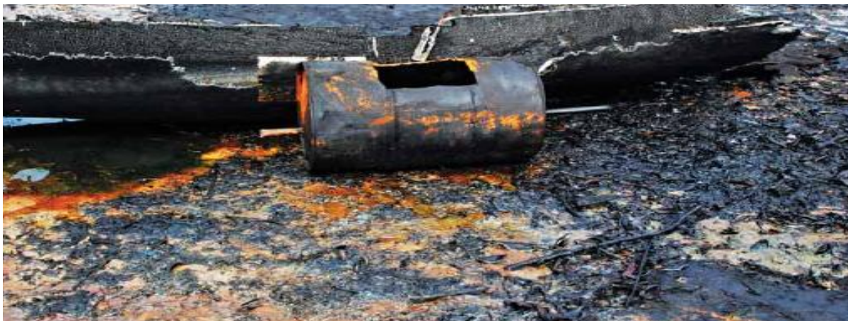
Plate 6: Remnants of an Artisanal Refinery in Southern Nigeria