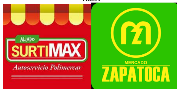
Figure 3 Allies

• Sales Forecast - Projections - Break-even Point: Las Delicias already has established customers, resulting in fixed sales with its various partners.