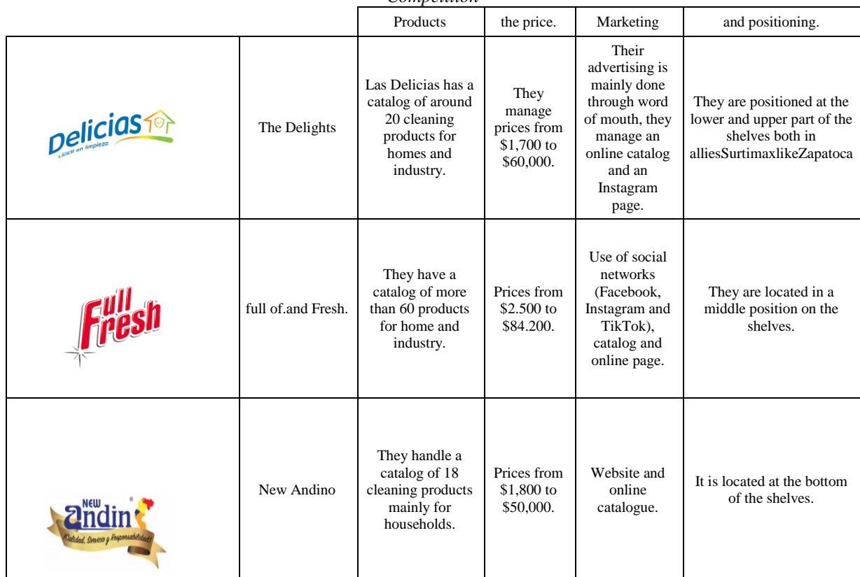
Table 2 Competition

A study was conducted across various retail outlets, specifically in the Zapatoca markets and its partner stores, Surtimax. These locations house the primary brands that directly compete with Las Delicias in the regular and maracuya-scented ecological Varsol product line. The objective was to conduct a direct comparison with key competitors, namely Full Fresh and Andino, whose market prices are detailed below. [6]