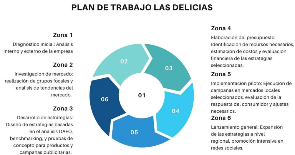
Figure 1. Work Plan

Strategy development is approached collaboratively, integrating internal knowledge and market trends to ensure innovative and relevant solutions. This process includes the creation of a detailed budget that ensures the appropriate allocation of financial resources, as well as a pilot implementation phase that allows for testing and adjusting the strategies before their full deployment. [4]