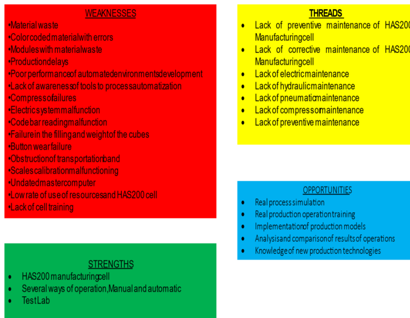
Figure 2. Matrix DOFA

In figure 2, we can observe matrix DOFA which enables to identify internal and external elements that affect the cell functioning.